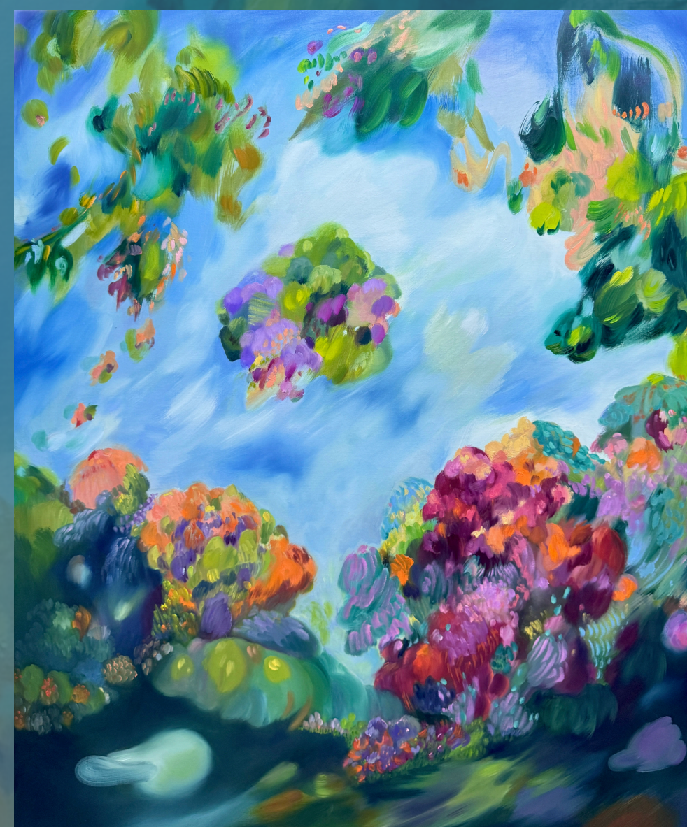
Whispers in Bloom - Fireflies Glowfield 《花語 - 螢之地》, 2025 Oil on canvas 布上油彩, 35 x 30 cm

In conclusion, “The Nature's Palette” invites us to reflect on our relationship with the world and recognize the profound influence that nature has on our lives. We invite you to join us in celebrating the beauty of silence and the transformative power of nature as we collectively seek to honour and protect the environment we inhabit.